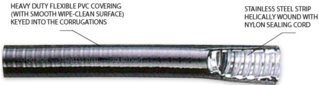
Stainless Steel Liquid Tight Conduit